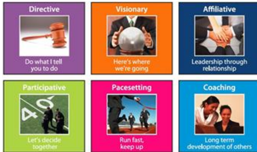
Figure 3. Examples leadership styles

decisions? Other possible discussion points are: chairing, setting agenda items, space to speak, inviting, requesting, interruption or ending discussion, proposal arrangements, and minutes.